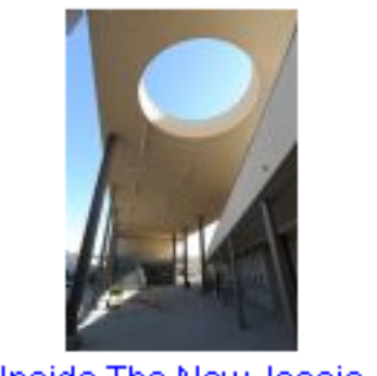
Inside The New Jessie Elwin Nelson Middle School in Signal Hill