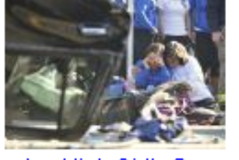
Avalon High Girl's Soccer team in roll-over traffic collision